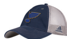
Adidas Flex Stretch Trucker Hat 30.00