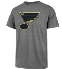
47 Brand Unisex T-Shirt 25.00