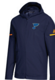
Adidas Squad Hooded Jacket 99.00