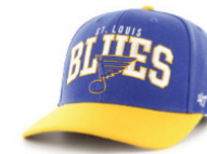
47 Brand Adjustable Hat 25.00