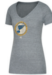
Adidas Ladies V-Neck T-Shirt 36.00