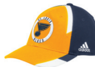
Adidas Flex Stretch 2-Tone Practice Hat 30.00