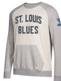
Adidas Fleece Tackle Twill Crew 89.00