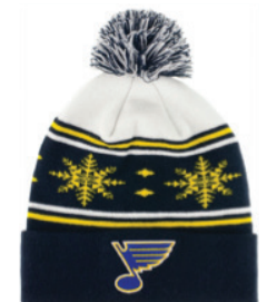
Main Gate Jacard Knit 15.00