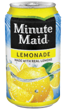
Minute Maid Lemonade 20.00