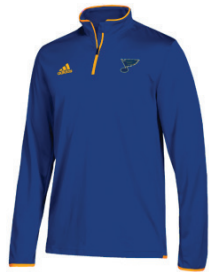
Adidas 1/4 Zip Jacket 79.00