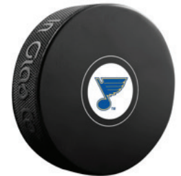
Sherwood Autograph Puck 8.00