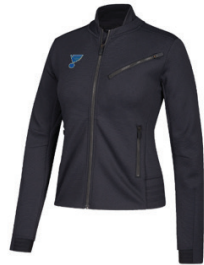
Adidas Ladies Bomber Jacket 115.00

Place your Order Today and receive your items in your party room or suite when you arrive. To order: Call 314-589-5944 or email us at lhoernig@rankandrally.com.