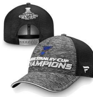
FANATICS STANLEY CUP CHAMPIONS HAT – GREY 35.00