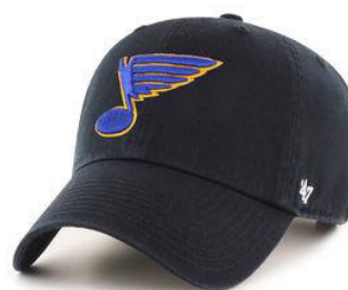
47 BRAND PRIMARY NOTE HAT – NAVY 25.00