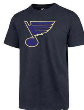
47 BRAND ST. LOUIS BLUES PRIMARY NOTE LOGO TEE – NAVY 28.00