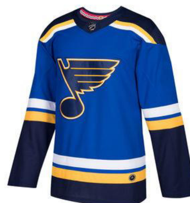
ADIDAS AUTHENTIC HOME JERSEY – BLANK 199.00