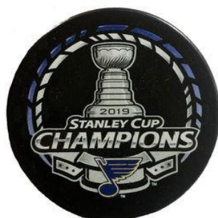
STANLEY CUP CHAMPIONS PUCK 13.00