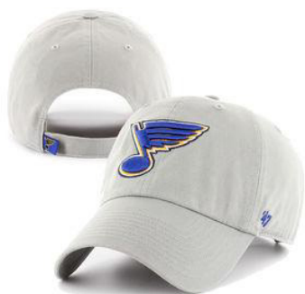
47 BRAND PRIMARY NOTE HAT – GREY 23.00