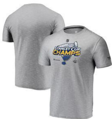
FANATICS STANLEY CUP CHAMPIONS TEE – GREY 35.00